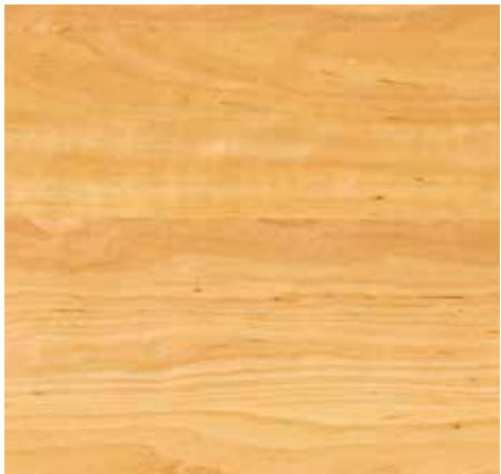
alder natural oil