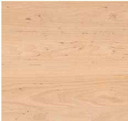
alder white oil